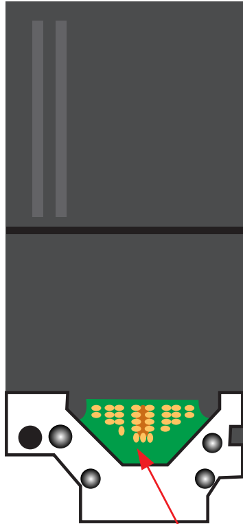
CONTACT SIDE VIEW

PCB not cut or evidence of replacement. No corrosion on contacts.