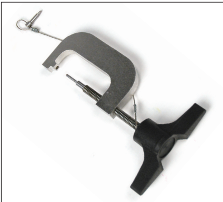
Drum Pin Removal Tool

Many remanufacturers struggle to build high quality color cartridges in a timely manner. With the introduction of the HP®3500/3700™ and the 3000/3600/3800™ color cartridges, a new hurdle was placed before the aftermarket by inserting a spring pin into the OPC hub that locks it into place with the OPC axle/shaft. The same problem exists on the HP®4700/4730/CP4005™ color cartridges.